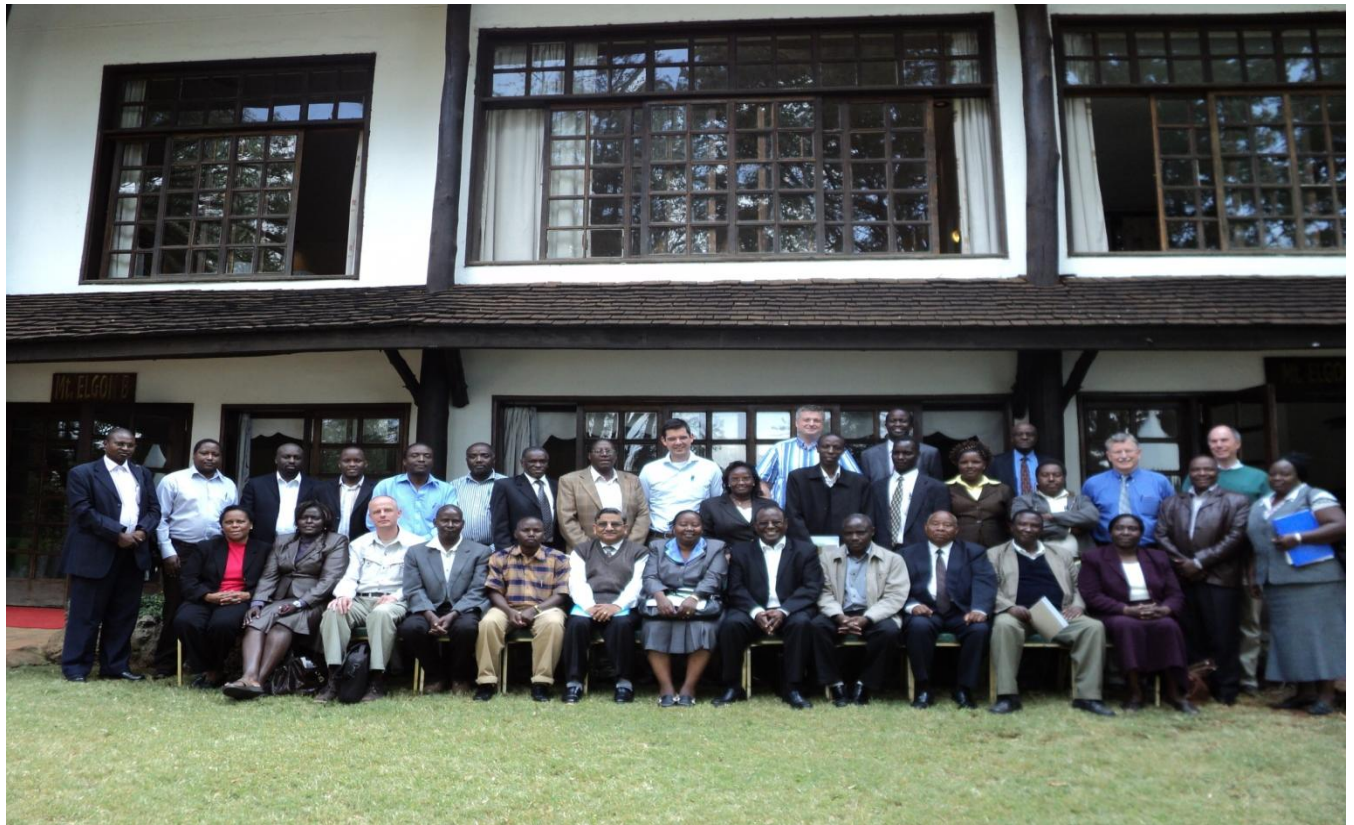
Participants of the East African sorghum value chain development project July 07, 2011 at the safari Park hotel

Lastly, my appreciation to the staff and management of Safari Park Hotel for the hospitality and good services during the workshops held in the hotel.